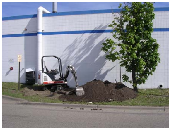
Excavation Site St. Paul, MN Climate Zone 1

Heat Flow Apparatus" immediately after excavation. Moisture content was determined by measuring the sample weight at the time of removal and again after being oven dried.